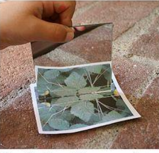
Exploring Symmetry in Nature